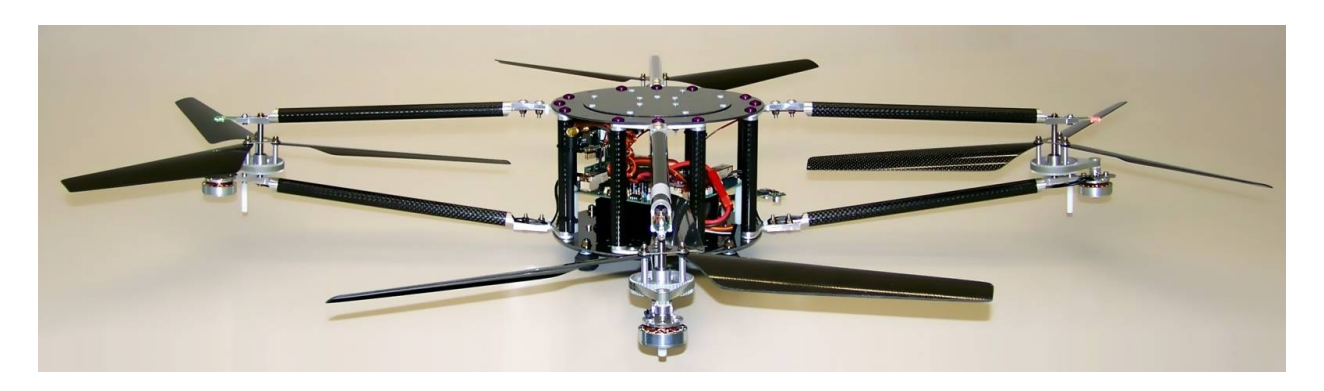
Figure 1: The JAviator quadrotor helicopter [6].

works. Interesting challenges are, in software and systems engineering, virtual vehicle migration to and isolation on real vehicles as well as, in control engineering, multiplexing flight control. For example, multiple virtual vehicles on the same real vehicle may require different flight plans that need to be properly negotiated by the VVM. The problem may be simplified by having real vehicles follow flight plans that are pre-determined by the vehicle provider. In this case, virtual vehicles do not alter the flight plans of real vehicles but may still migrate from one real vehicle to another. Vehicle migration across wireless links is nevertheless challenging and may only be possible with small-footprint, light-payload virtual vehicles. Vehicle isolation is another key challenge that involves non-trivial, real-time process scheduling and management.